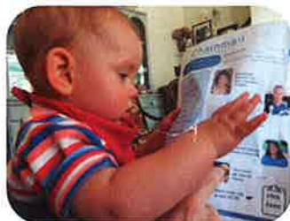
Youngest ever proof reader?