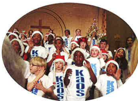
Christmas Signs from KAOS Choir