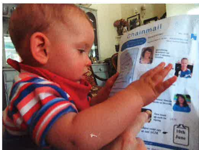
At 10 months she “proof-reads” the May issue!